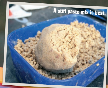
A stiff paste mix is best.